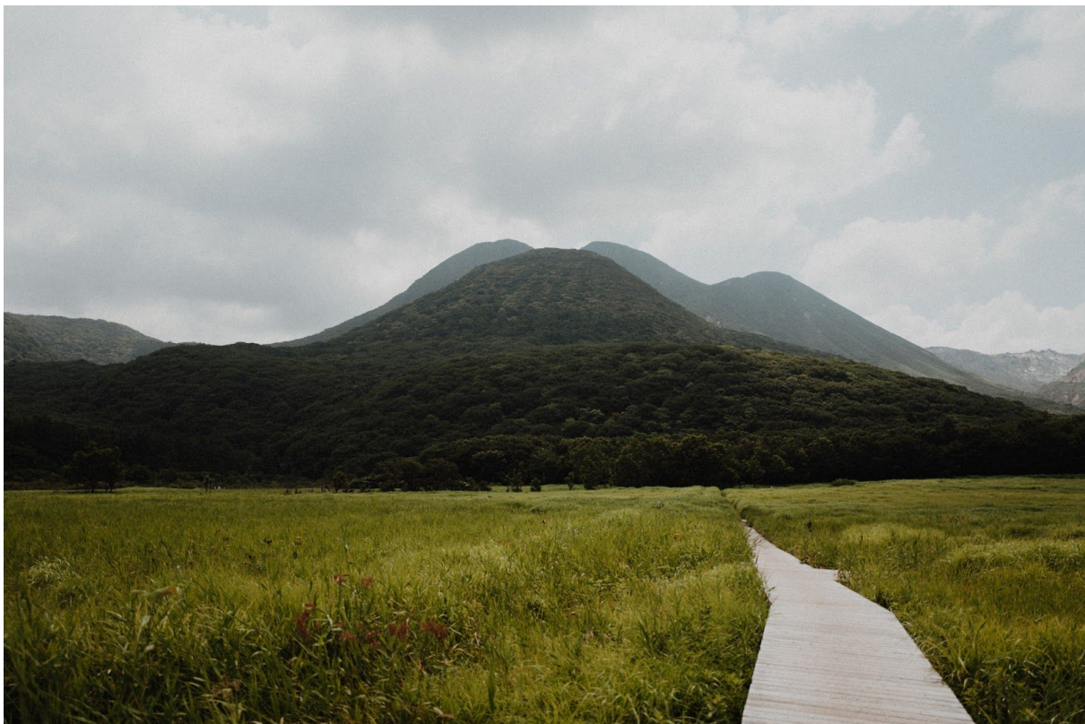
Happy Hikers Hakkien Gathering approach.