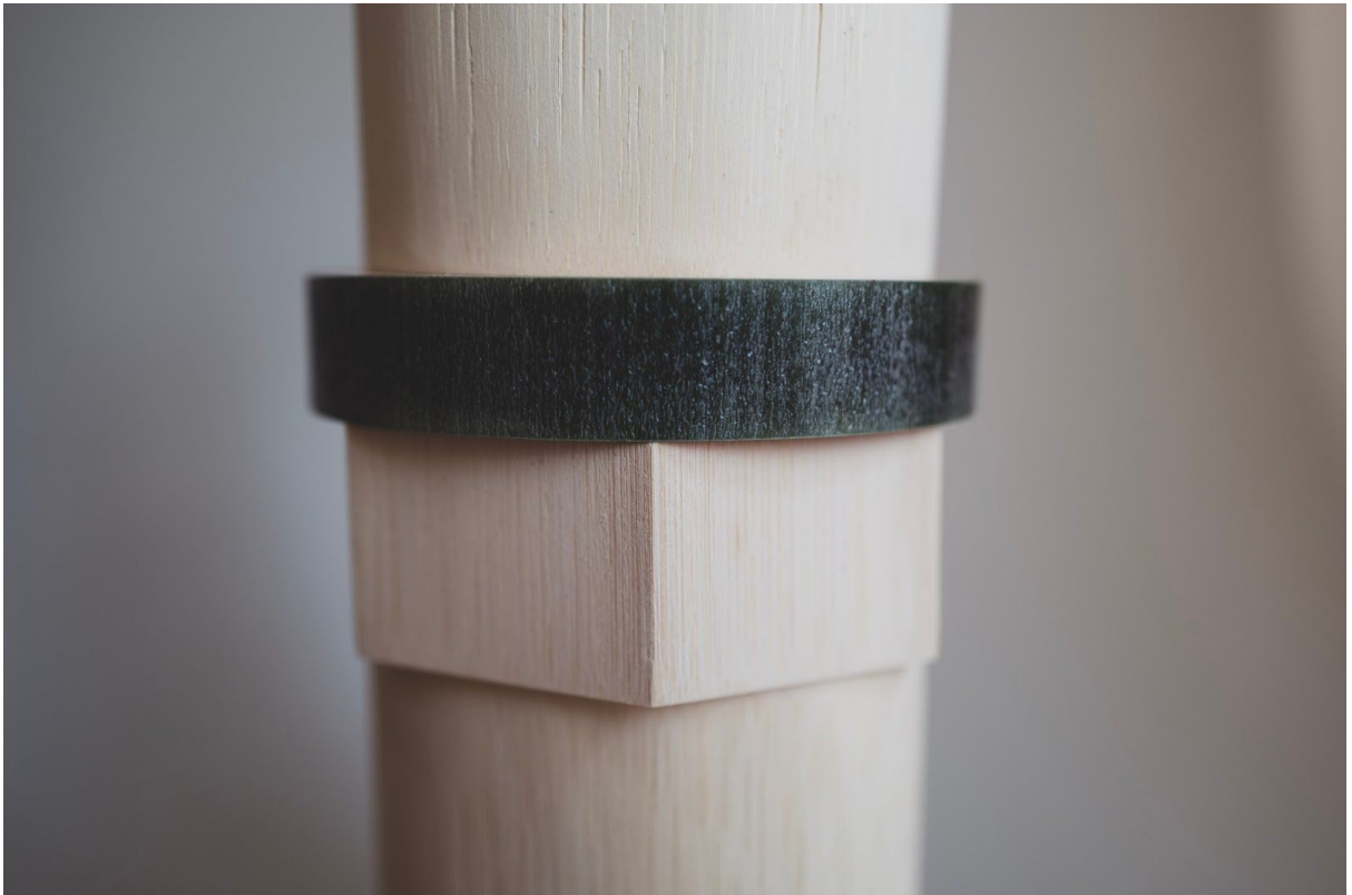
Archetypal, Thing #07