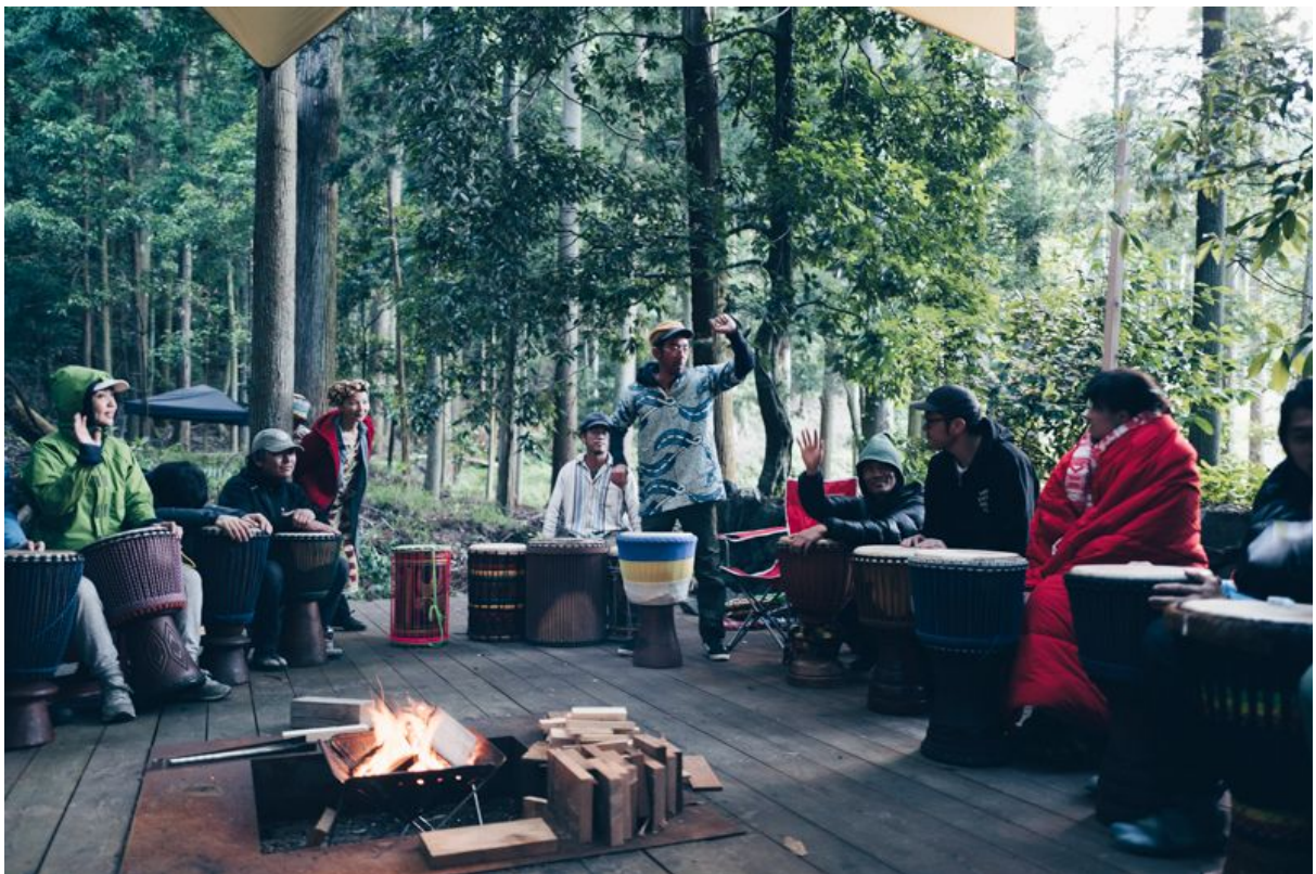
Workshop : Tres Tres Africa.