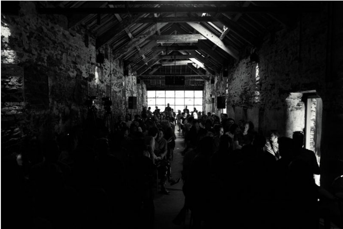
The Do Lectures, Lecture Barn.