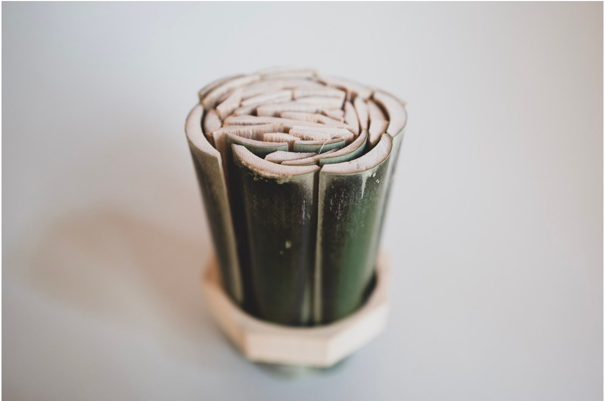
Archetypal, Thing #04