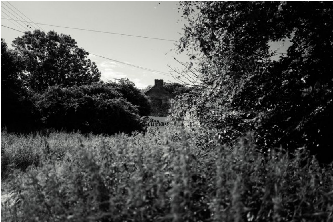
The Do Lectures.