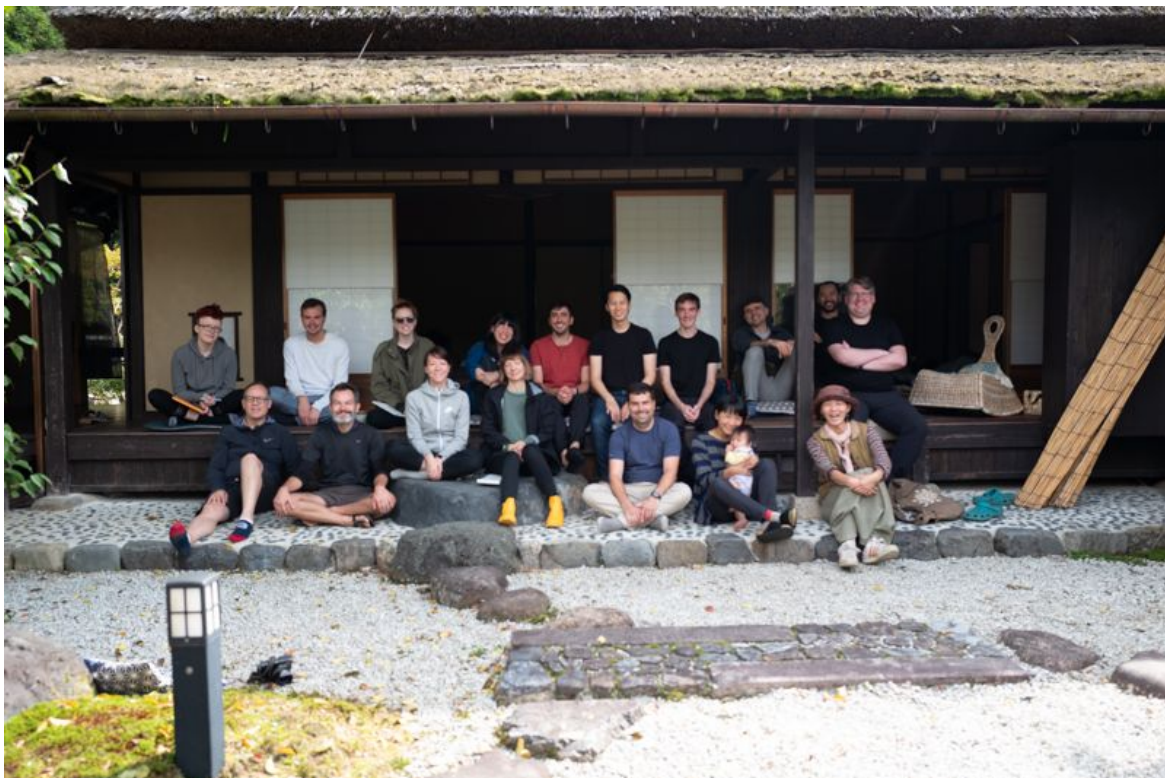
Field / North Kyoto Retreat 2018.

The minka is deep in Japan's timber country, close to a river and surrounded by pine forests. It is also a short walk to the fabled Jōshōkōji Temple. We held the retreat here in 2019 and were impressed by how the venue and our gracious Japanese hosts who are both designers—it made for a compelling experience.