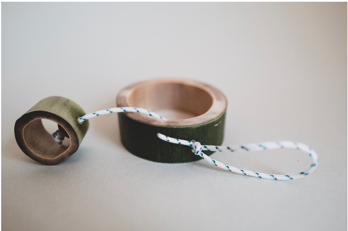
Archetypal, Thing #01

In an attempt to understand my relationship with the things I need , want and use , I will endeavour to make a collection of archetypes, exploring my emotional connection to each and every one. Some may seem to have a clear function, while with others, their purpose may feel ambiguous. Yet in all cases, it is an expression of joy.