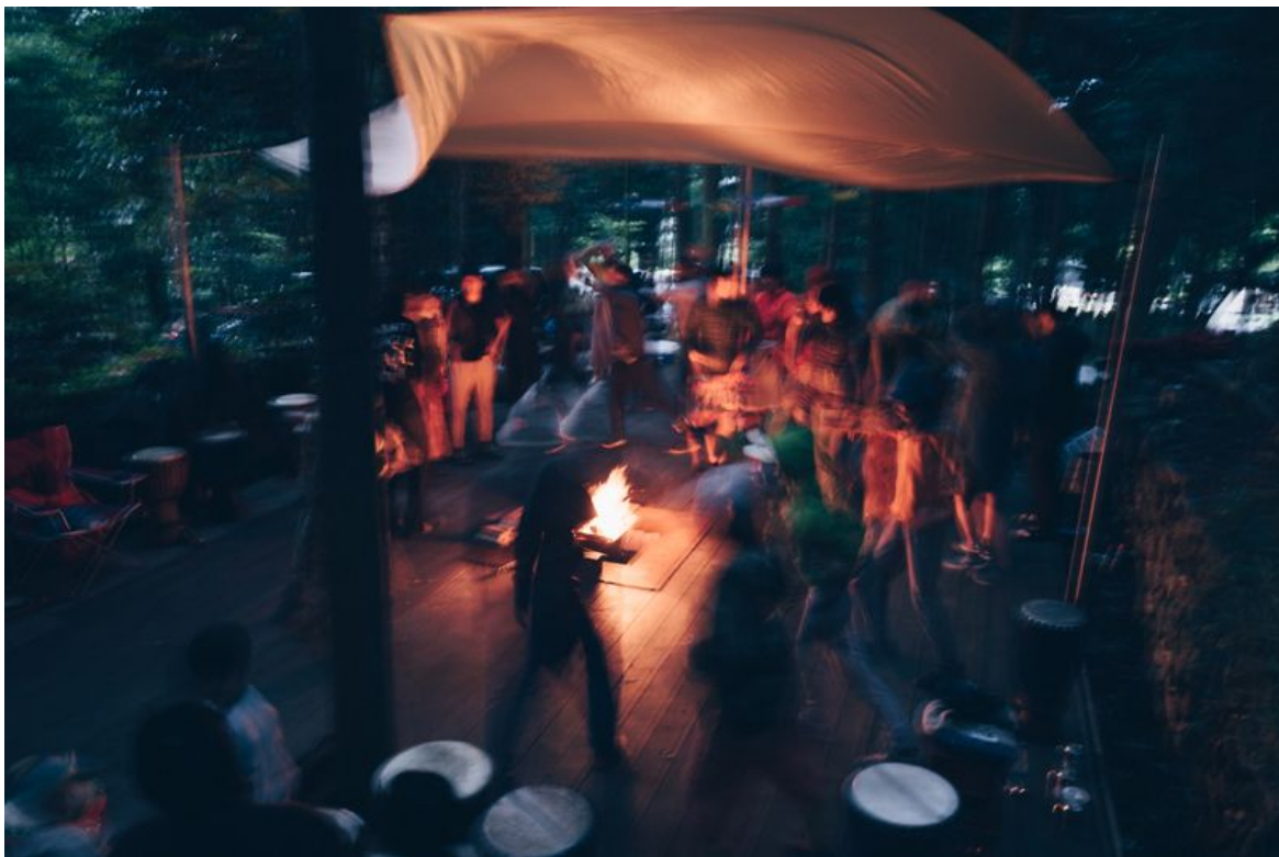
Workshop : Tres Tres Africa.