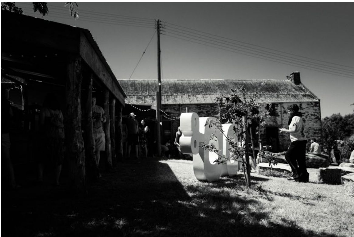
The Do Lectures.